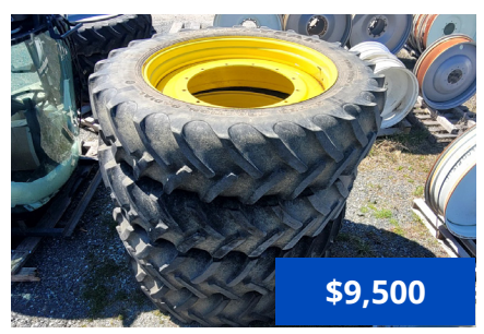
2013 Goodyear 480/80R50 tires for a John Deere 4940 self-propelled wheels and tires (40% remains). (PA) U1585A