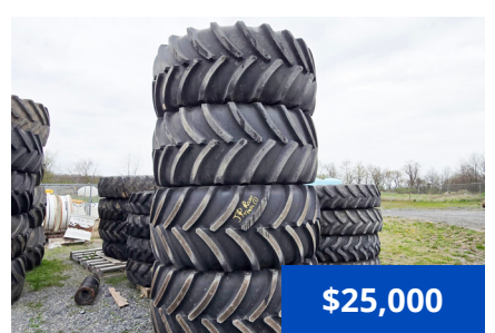
Set of 4 Goodyear 900/50R46 floater tires (50% remains). Three sets available. (PA) U1591A, U1593A, U1594A