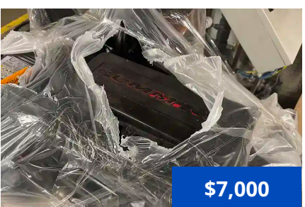
2019 Cummins QSL9 Diesel Engine, Used Cummins engine, 6 cylinder, 9L, 350 hp at 2100 rpm. (PA) U1558