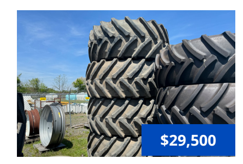
Set of 4 Trelleborg 900/60R42 floater tires (90% remains). (PA) U1582A