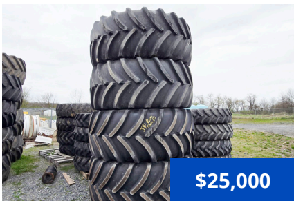
Set of 4 Goodyear 900/50R46 floater tires (50% remains). Three sets available. (PA) U1591A, U1593A, U1594A