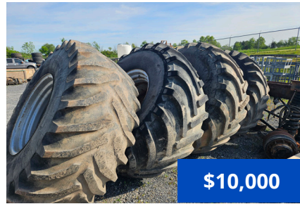
Set of 4 Goodyear 800/65R32 floater tires (50% remains). (PA) U1590A