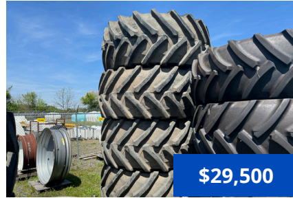
Set of 4 Trelleborg 900/60R42 floater tires (90% remains). (PA) U1582A