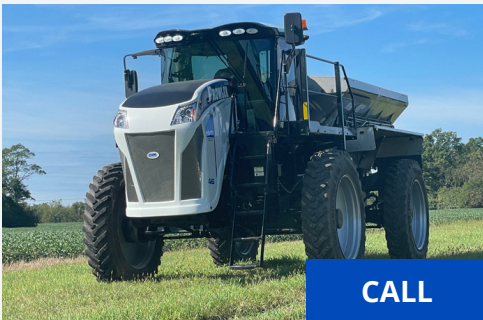
2023 GVM T380 Prowler , Cummins QSL9 380 hp turbo diesel engine, HVT R2 trans. with joystick control, Meritor axles, 2WS, 304SS GVM 11.0T Double Duty SR1 spreader body with reverse rotating spinners, 1-section shutoff, bulkhead window, 124 in. fenders, Raven Viper 4 with RS-1 ISO steering receiver, A/C, AM/FM/BT radio, air ride seat, roll tarp, front fenders, 380/90R46 Trelleborg row crop tires. Includes 3-yr/3000 hrs. EPG Premier Warranty.