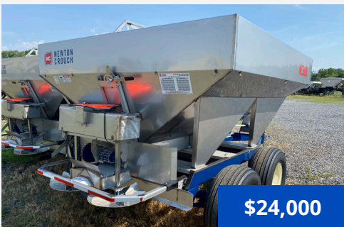
2022 Newton Crouch NC5000 , 5 ton, 163 cu. ft. capacity, designed for fertilizer spreading, 50 ft spread pattern, 304 SS hull, dishes, inverted vee, blades and conveyor, trailer painted blue powder coat, trailer frame reinforced of 2 x 6 inch tube, 7 in. conveyor chain, dual 19 in. dishes with 6 blades, universal joint on spinner drive shaft, ground driven conveyor, 6 bolt hubs, 7000 lb drop leg tongue jack, braided nylon rope pull, 540 PTO drive with twin spinners, 6 leaf and double eye springs, roll tarp fitted with stainless tarp bow, 11L x 15 - 8 ply tires.