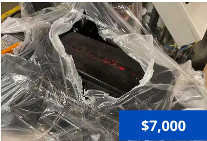
2019 Cummins QSL9 Diesel Engine, Used Cummins engine, 6 cylinder, 9L, 350 hp at 2100 rpm. (PA) U1558