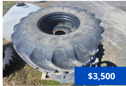
Set of 2 Firestone 800/65R32 floater tires on 10-bolt rims, will fit any GVM make and model Prowler. (PA) U1588