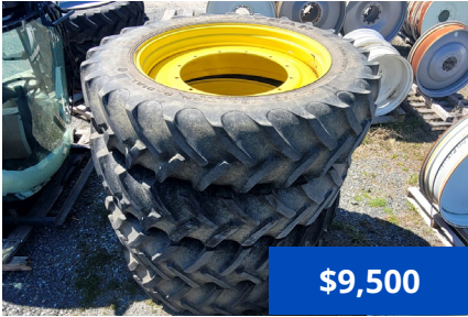
2013 Goodyear 480/80R50 tires for a John Deere 4940 self-propelled wheels and tires (40% remains). (PA) U1585A