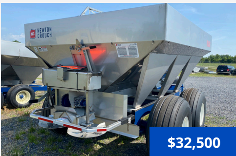
2022 Newton Crouch NC6000N , 6 ton, 204 cu. ft. capacity, designed for fertilizer spreading, 50 ft spread pattern, 304 SS hull, dishes, inverted vee, blades and conveyor, trailer painted blue powder coat, trailer frame reinforced of 2 x 6 inch tube, 7 in. conveyor chain, dual 19 in. dishes with 6 blades, universal joint on spinner drive shaft, ground driven conveyor, 8 bolt hubs, 7000 lb drop leg tongue jack, braided nylon rope pull, 540 PTO drive with twin spinners, 5 leaf slipper springs, roll tarp fitted with stainless tarp bow, 16.5L x 16.1 - 10 ply tires. SN: 11-22-13544 (OH)